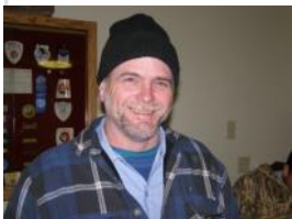
Nor Cal / Legislative

What is Nor Cal? The full name for this regional group is Nor Cal Bowhunters. They represent the areas 9 archery/bowhunting clubs and 3 archery pro shops to California Bowmen Hunters State Archery Association (CBHSAA). CBHSAA and Nor Cal are chartered to the National Field Archery Association (NFAA). What do Nor Cal and CBHSAA do for Archery or Bowhunting? There are many facets to their representation of Archery and Bowhunting. CBHSAA is "Dedicated to Promoting and Protecting the Archery and Bowhunting Heritages". This statewide organization speaks for California Archers and Bowhunters in matters concerning Legislation and Regulation since 1943. The Legislative committee of CBHSAA includes a Coordinator, 6 state area reps and each region group has one legislative representative. Archery is a shooting sport so at times issues