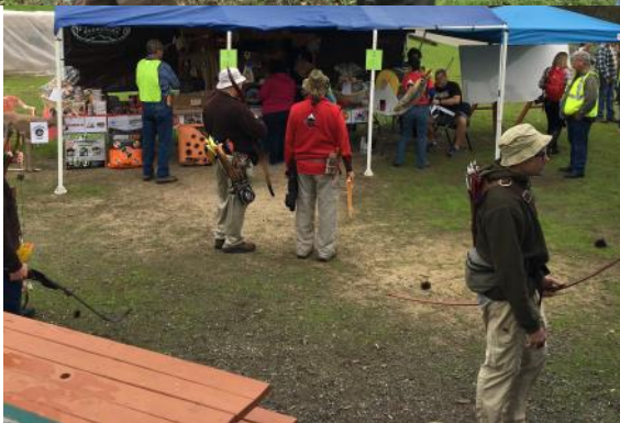
Left- The Flying Goose Below-Tire swing target Below left- Raffle Prize booth